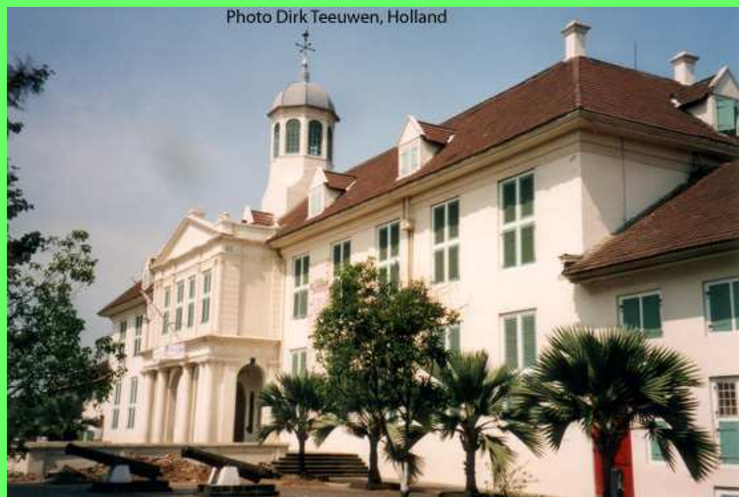
9. Batavia Town Hall, Jakarta 2006

8. The Batavia Town Hall in 1680 Nieuhof, J.: Gedenkwaerdige Zee en Lantreize door de voornaamste Landschappen van West en Oost Indien, Vol. II; Amsterdam 1682, page 198 In: Feith, Esq. P.R.: Catalogus boeken en prenten van de stad Batavia; Batavia 1937, page 30 (Library Dirk Teeuwen, Holland {Feith})