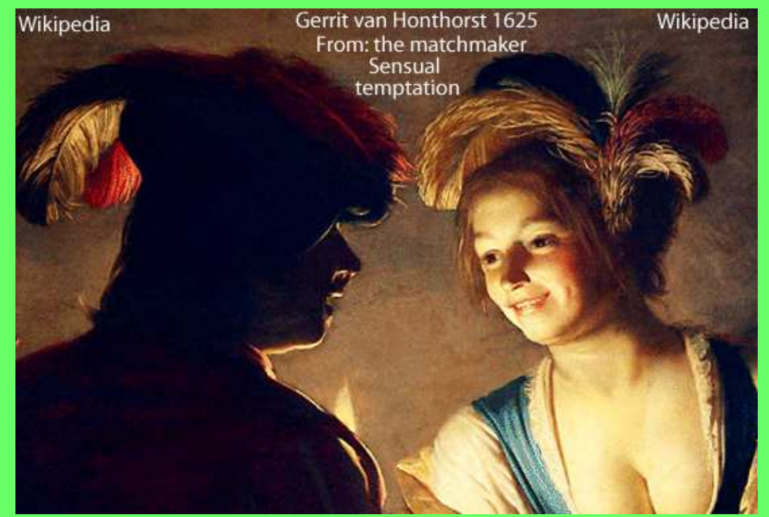
3. Sensual temptation, from "The procuress", a painting by the Dutchman Gerrit van Honthorst, 1625 (In the public domain) <u>https://commons.wikimedia.org/wiki/File:Gerard van Honthorst - The procuress</u>