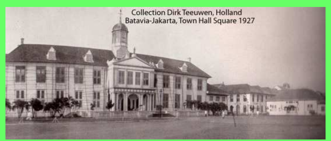
2. Town Hall Square in 1927, all these colonial buildings are still there. Vries, J.J. de: Jaarboek van Batavia en Omstreken 1927; Batavia-Weltevreden 1927 (by Kolff&Cy), page 553 (Library Dirk Teeuwen, Holland)